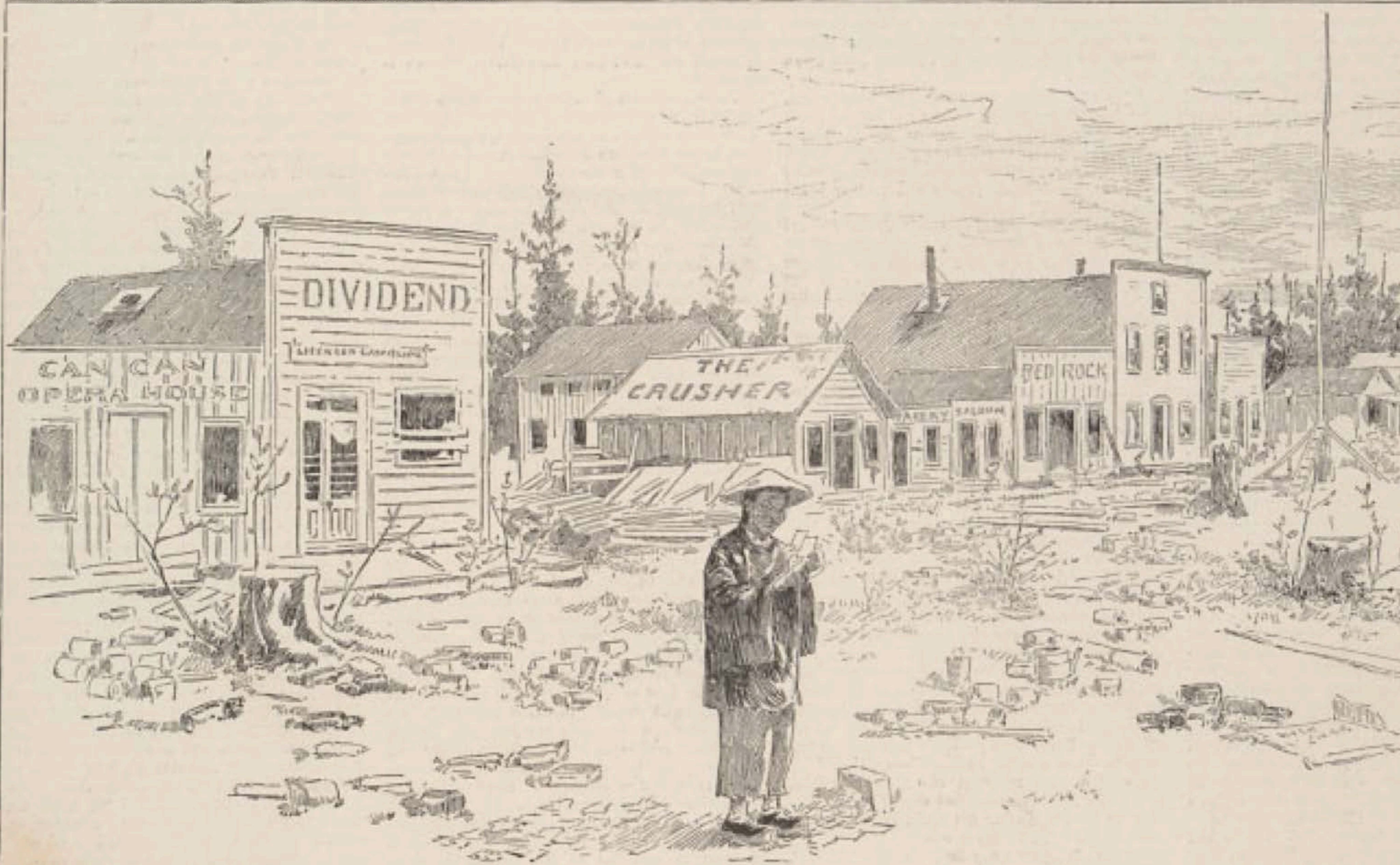
THE "BURSTED" BOOM.