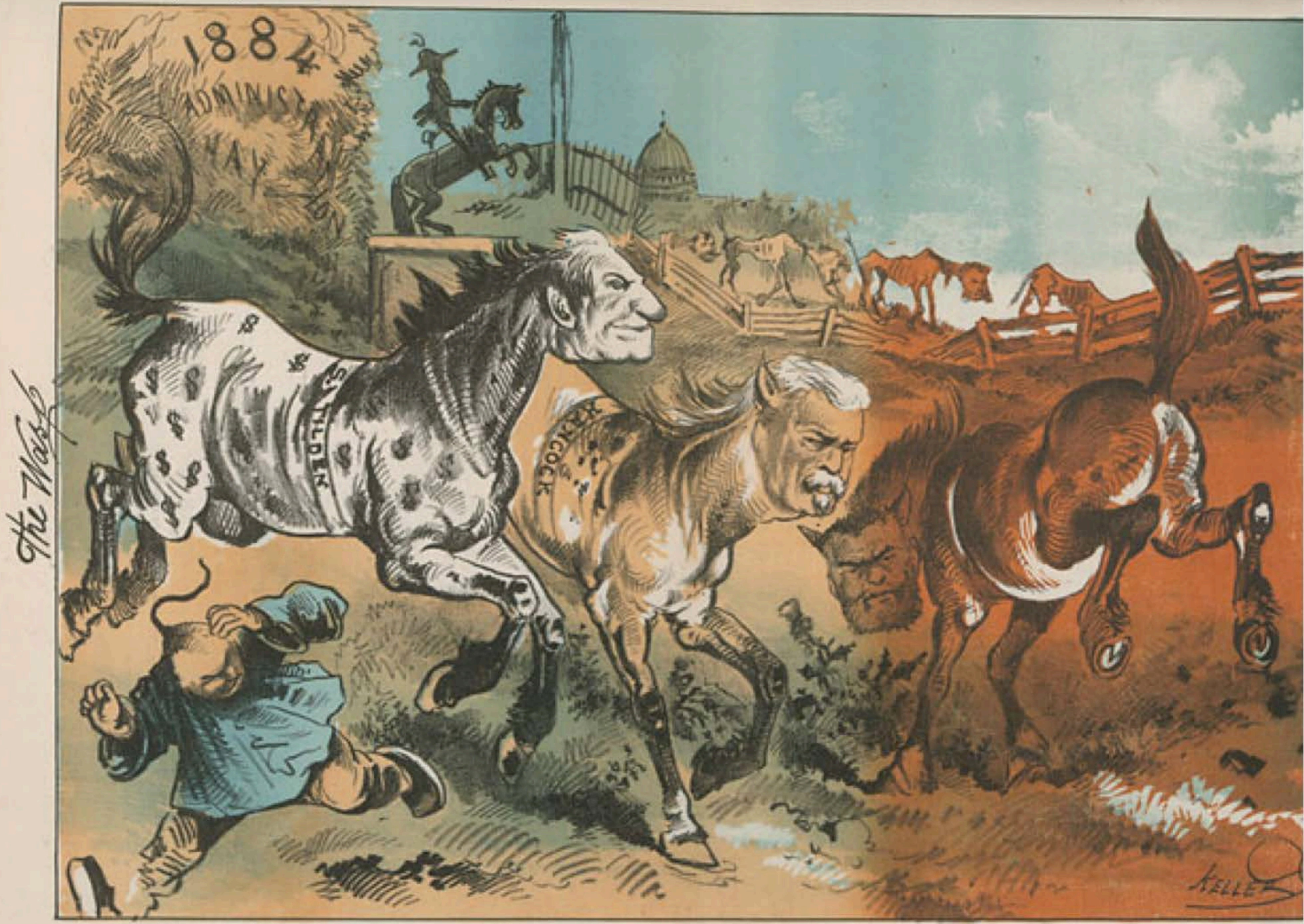
A. JACKSON'S SPIRIT AMONG THE OLD DEMOCRATIC WAR HORSES.